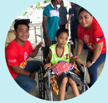
Heart on Wheels A recipient of brand new wheelchair from far flung area of Sitio Magaud, Loreto.

This successful initiative reflects the Rotary Club of Central San Francisco's dedication to the Rotary motto, "Service Above Self".