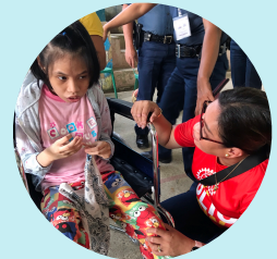
Heart on Wheels Recipient of brand new wheelchair from Brgy. Ormaca, SFADS.