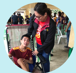
Heart on Wheels Recipient of brand new wheelchair from Prosperidad, Agusan del Sur.